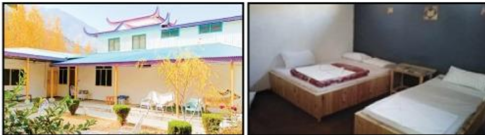
Islamabad: Index Hotel/ Sazeen Hotel or Equivalent.