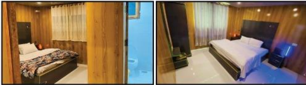
Gonar Farm: Safe Heaven Guest House or Equivalent